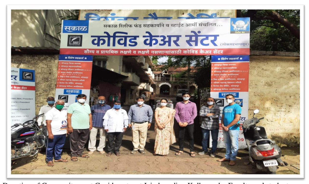
Donation of Grocery items at Covid center at Jain boarding Kolhapur by Faculty and students